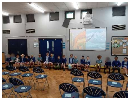
Year 2 Badgers Class Assembly