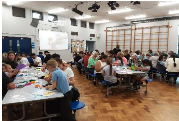
Our Year 1 Puppet making workshop was well attended by parents

Many of our classes are covering aspects of plants as their Science this term. If you have any spare seeds we could have please can you drop them at the school office or send them in with your child. Many thanks in advance ☺