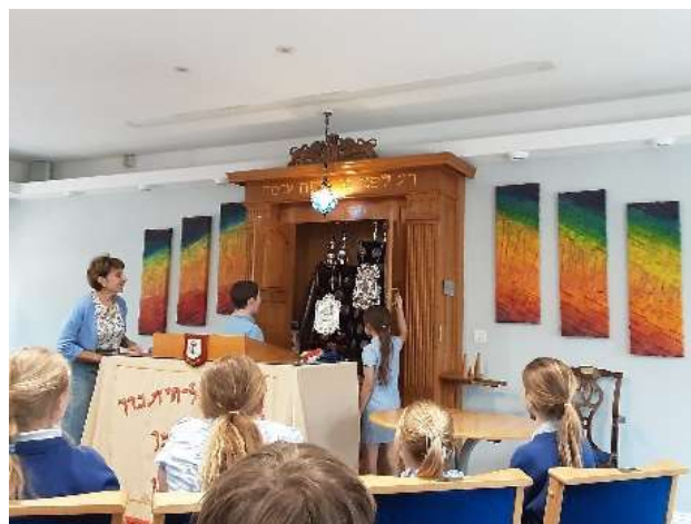
Our Year 4 Children attending the Synagogue